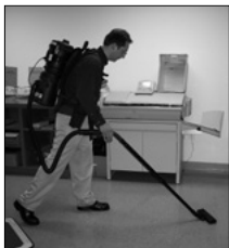
Cordless operation accelerates spot vacuuming in office areas.