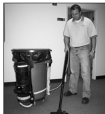
The Outlaw PB can also be mounted on a large barrel. Requires 2 Barrel Hangers (#6990781), 10ft hose (#6990801) and Accessory Skirt (#6990791)