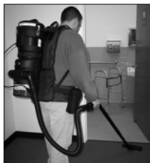
In addition to the enhanced safety benefits of a cordless design, the Outlaw PB's quiet operation makes it ideal for healthcare facilities.